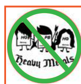
Free of Heavy Metals