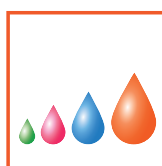
Piezo Variable Drop