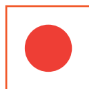
Made in Japan