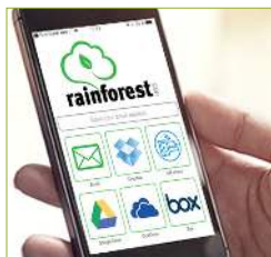
Cloud enabled with rainforest365