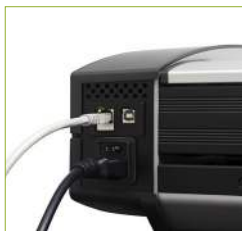
Up to 14 ips in color across corporate networks