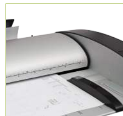
Guides for easy handling