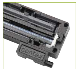
Contex CleanScan CIS