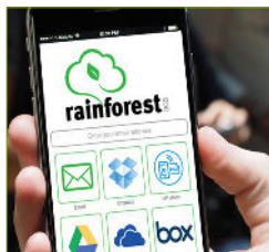
Cloud enabled with rainforest365