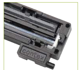
Contex CleanScan CIS