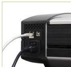
Up to 14 ips in color across corporate networks