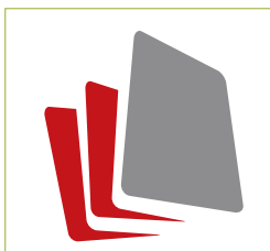
IQ Quattro is recommended for workgroup usage