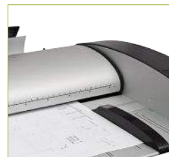
Guides for easy handling