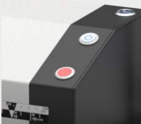
Save scans to the USB-port

The WideTEK36CL-600-MF5 solution is by far the fastest color CIS scanner on the market, running at 10 inches per second at 200 dpi in full color. At the full width of 36" and at 600 dpi resolution, the scanner still runs at 1.7 inches per second. The scanning speeds are tripled in black and white and greyscale modes but can be individually configured if required; for example, to scan fragile, valuable documents.