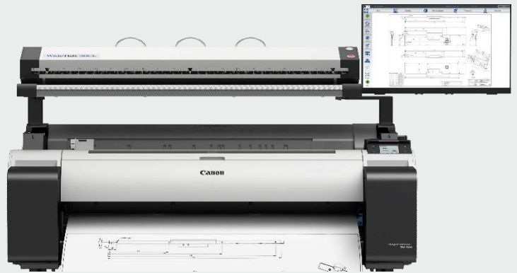
Scanner mounted on Canon printer