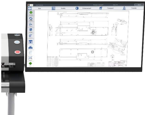
21 Inch preview monitor mounted to the side of a WideTEK scanner