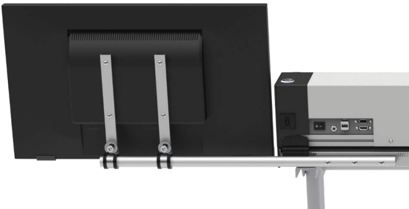
Rear view of the WideTEK-TOUCH21