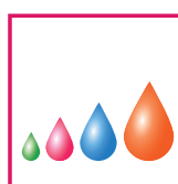
Piezo Variable Drop