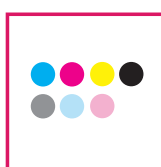
CMYK + Lc, Lm & Lk

* For heavy-duty applications where mechanical stress or environmental impact is involved (floor, vehicle and marine graphics), lamination is required. Stabilisation is required prior to lamination.