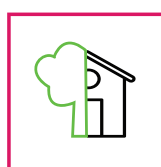
Outdoor / Indoor