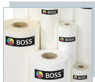
BOSS FILM SUPPLIES

Vivid design and manufacture a wide range of laminating systems, specialising in function, style and reliability.