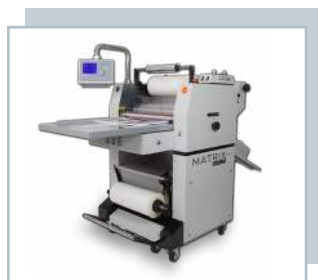
MATRIX DIGITAL FOILING & LAMINATING SYSTEMS

• Yes - No • Special order Non-exhaustive list. Consult us for full stock and availability.