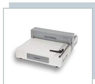
MAGNUM CREASING SYSTEMS