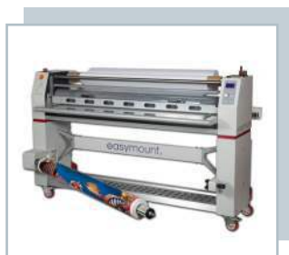
EASYMOUNT WIDE FORMAT SYSTEMS