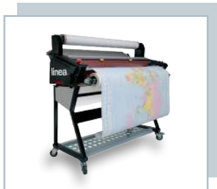
LINEA ENCAPSULATION SYSTEMS