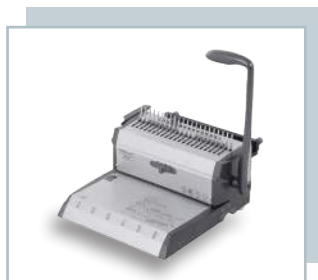
MAGNUM BINDING SYSTEMS