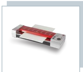
PEAK POUCH LAMINATING SYSTEMS