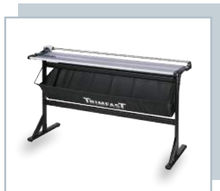
TRIMFAST TRIMMING & CUTTING SYSTEMS