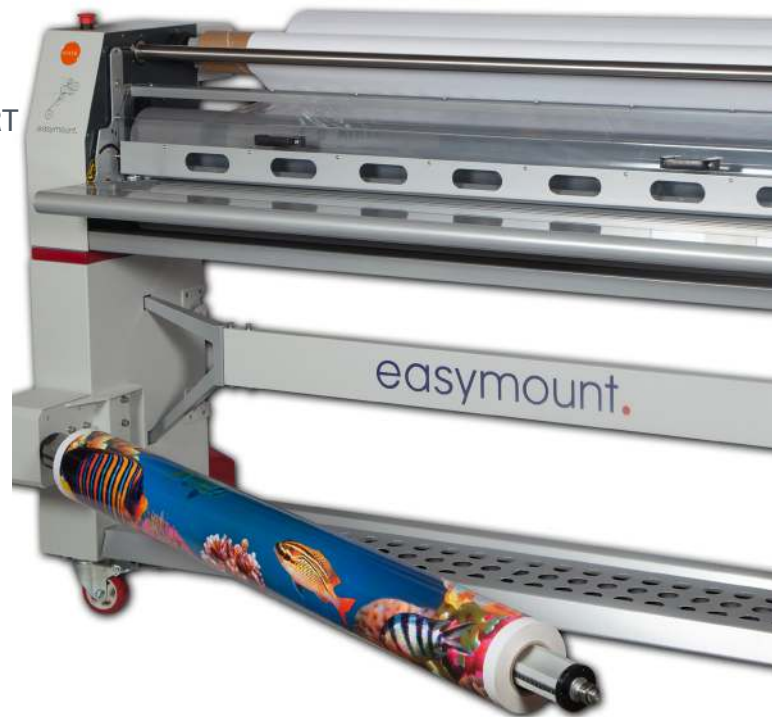
▲ EM-1600SH - with swing-out arm for loading vinyl

Designed in-house by Vivid, the Easymount range gives your business extra capacity by allowing you to offer your customers a complete service that you previously had to outsource.