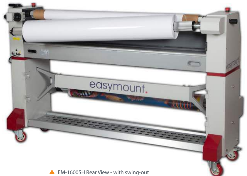
▲ EM-1600SH Rear View - with swing-out arm for loading laminate

The arms makes loading both vinyl and media a whole lot easier and less time-consuming, with no compromise on the finish.