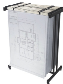
ECO mobile stands Est. 1991