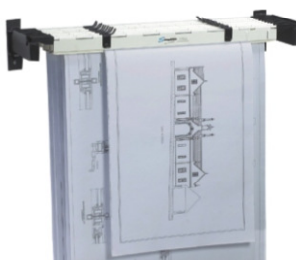
ECO wall racks